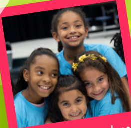
Friendships all year long!